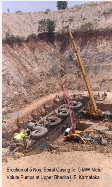
Erection of 5 Nos. Spiral Casing for 5 MW Metal Volute Pumps at Upper Bhadra LIS, Karnataka.