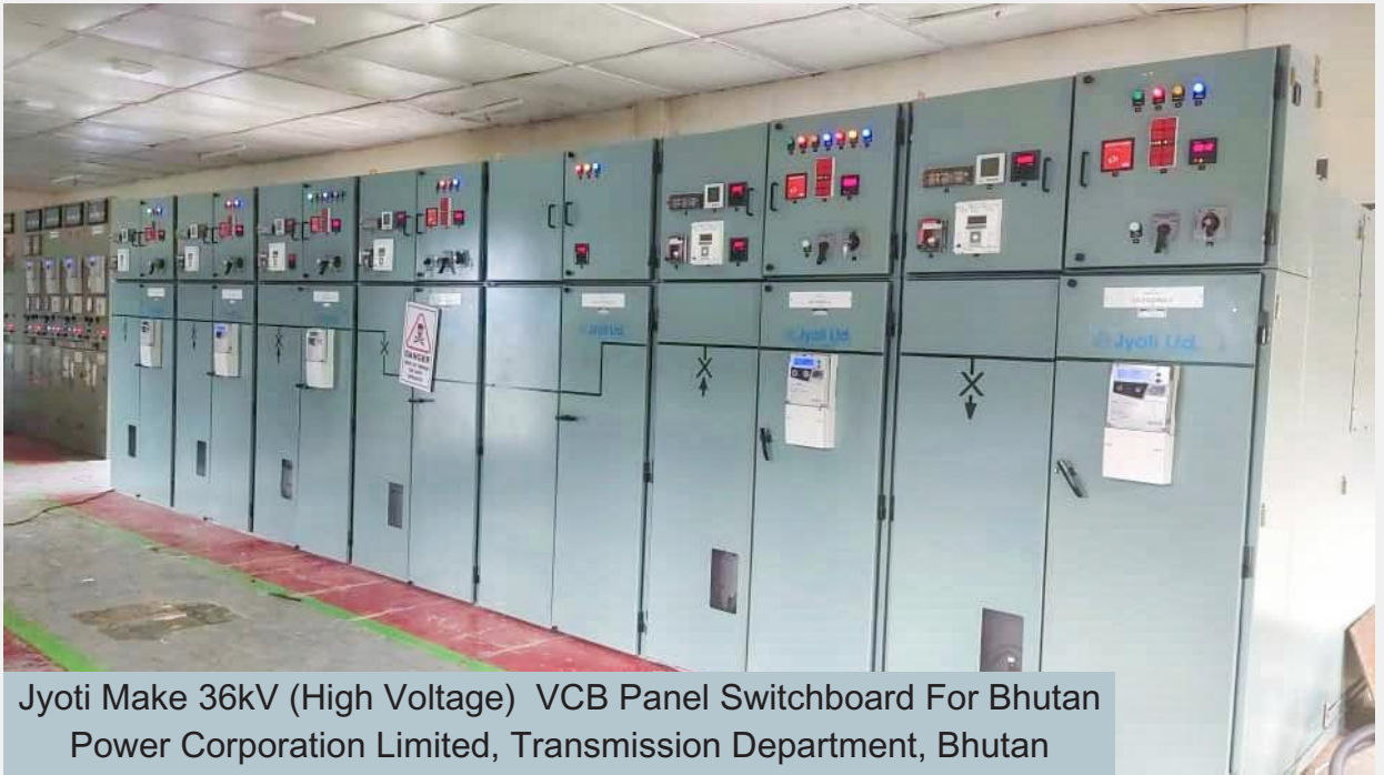
Jyoti Make 36kV (High Voltage) VCB Panel Switchboard For Bhutan Power Corporation Limited, Transmission Department, Bhutan