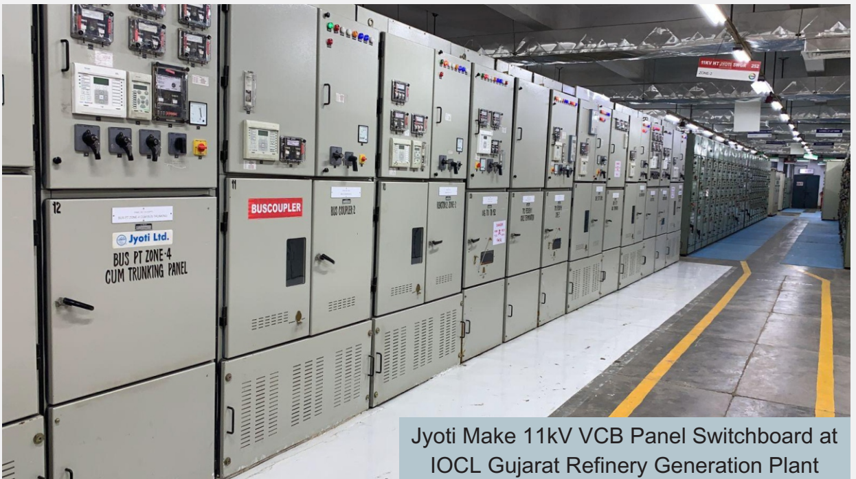
Jyoti Make 11kV VCB Panel Switchboard at IOCL Gujarat Refinery Generation Plant